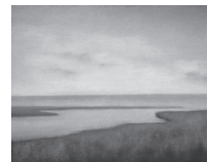
Christie Scheele "Vagabond Light"

Contemporary & American Modernist Paintings, Drawings, Sculpture