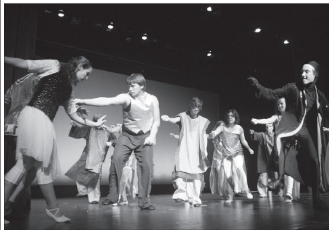
DANCING THEIR WAY TO DEBUT AT EDINBURGH FRINGE FESTIVAL.