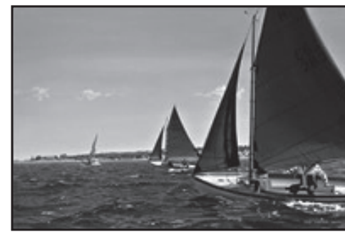
"Brown Sails" Acrylic by Ovid Ward