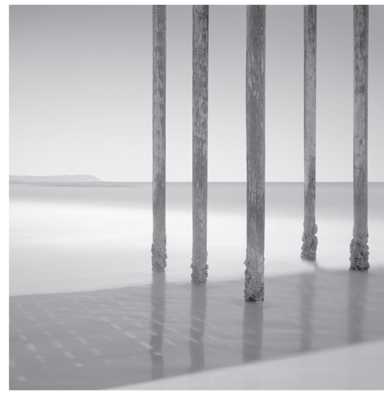
Long Poles, San Simeon, CA

636 Old County Rd ~ PO Box 790 ~ West Tisbury, MA 02575 (508)693-0455