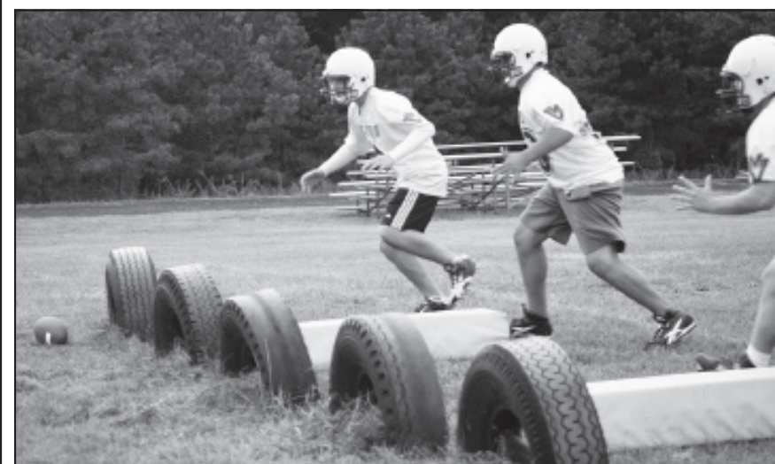
SUMMER PRACTICE IS NO DAY AT THE BEACH.