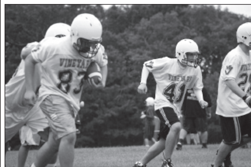
HALF PADS BUT NOT HALF SPEED.