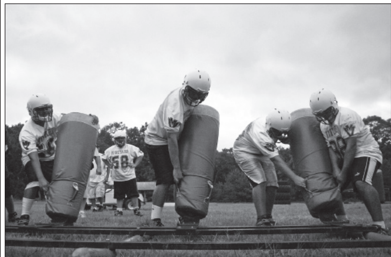
HITTING HARD ON THE GRIDIRON.