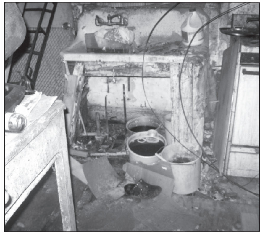
NEIGHBORS' KITCHENS: "You never know what goes on behind closed doors. Some people need to know exactly how we're living being single moms, being that we're on our own and we don't have that many opportunities."