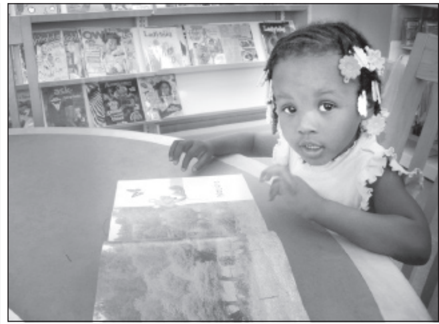
LIBRARIES: "They don't see a lot of different things. They don't run into a lot of different cultures or a lot of different people from different backgrounds."